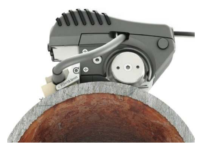
Figure 3. A 2D encoded scanner like Zetec's NDT PaintBrush combines precise data collection with accurate positioning in any direction on flat or curved surfaces, ideal for mapping pipeline corrosion.