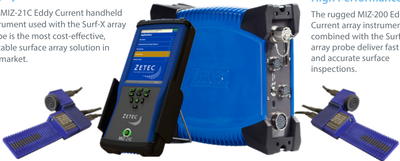
MIZ®-21C Array: (PN 111A903-00)

The rugged MIZ-200 Eddy Current array instrument combined with the Surf-X array probe deliver fast and accurate surface inspections.