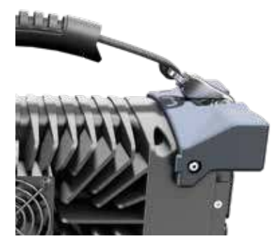
No air intake

New 64 bit onboard computer delivers extra computing power and reduces processing time by a factor of two improving operation fluidness of the instrument.