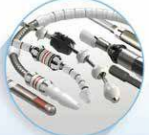
PROBES & WEDGES