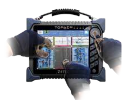
Run it with a touch

SINCE ITS LAUNCH, TOPAZ HAS SET A NEW STANDARD FOR PORTABLE PHASED ARRAY UNIT PERFORMANCE. THE NEW TOPAZ<sup>32</sup> REDEFINES PRODUCTIVITY, MAKING IT A SMART INVESTMENT. TOPAZ<sup>32</sup> DELIVERS SPEED AND ONBOARD PROCESSING POWER TO ALLOW FOR LARGER ONBOARD DATA FILES, FASTER ANALYSIS AND SPECIAL NEW TOOLS. PLUS, TOPAZ NOW SUPPORTS 2D DUAL MATRIX PROBES.