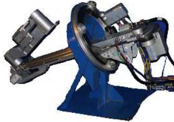
Installation of the Arm/Pole