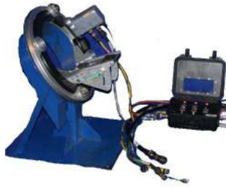
Installation of the Manway

The modular design of the SM-23G allows the robot to be easily installed by one person