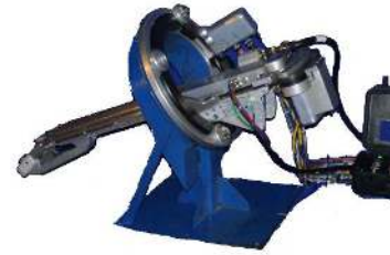
Installation of the Trunk