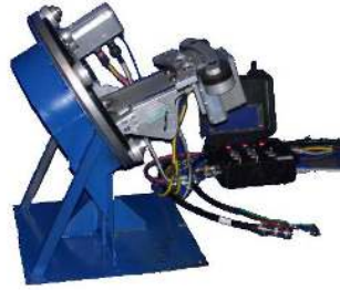
Installation of the Support Plate