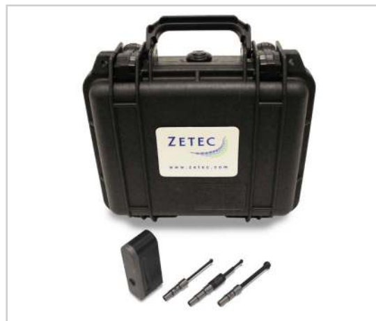
ZM-5 High Speed Rotating Scanner includes a sturdy, lightweight carrying case.