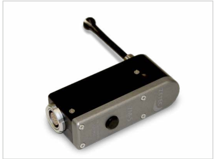
Rapid, thorough inspection of small diameter holes with the ZM-5 High Speed Rotating Scanner enables operators to inspect faster and with greater accuracy.

The MIZ-21C provides a visual and audio indication to inform the operator whenever there is in an alarm condition.