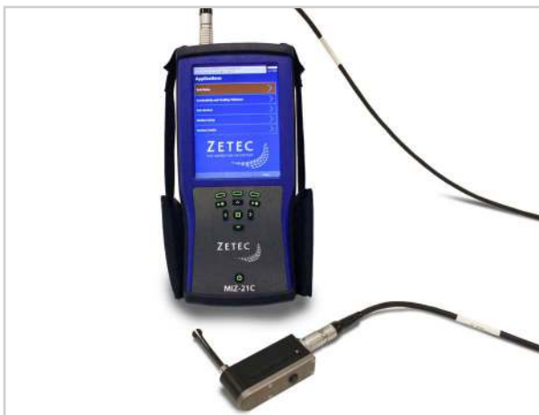
The ZM-5 with Reflection Scanner Probes and MIZ-21C provides a complete "ready-to-test" system.