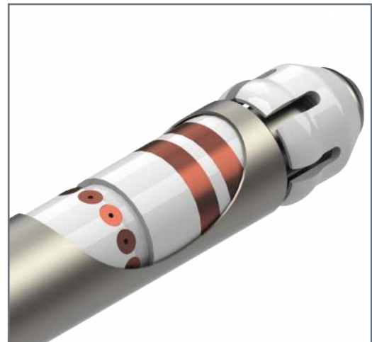
CXB2 probe magnified