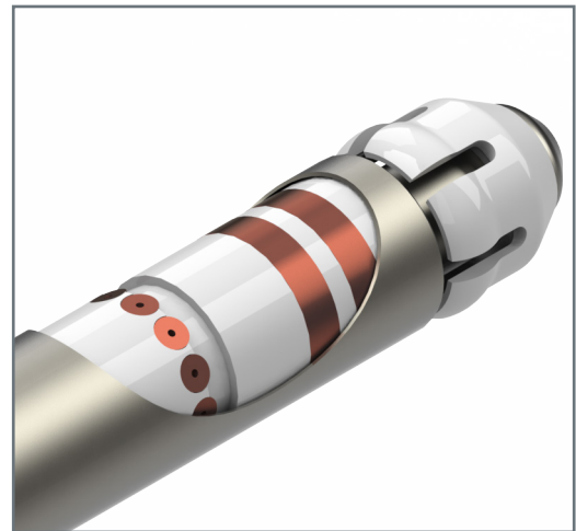
CXB2 probe magnified